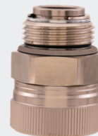
L-FS19 (Straight Swivel 3/4")